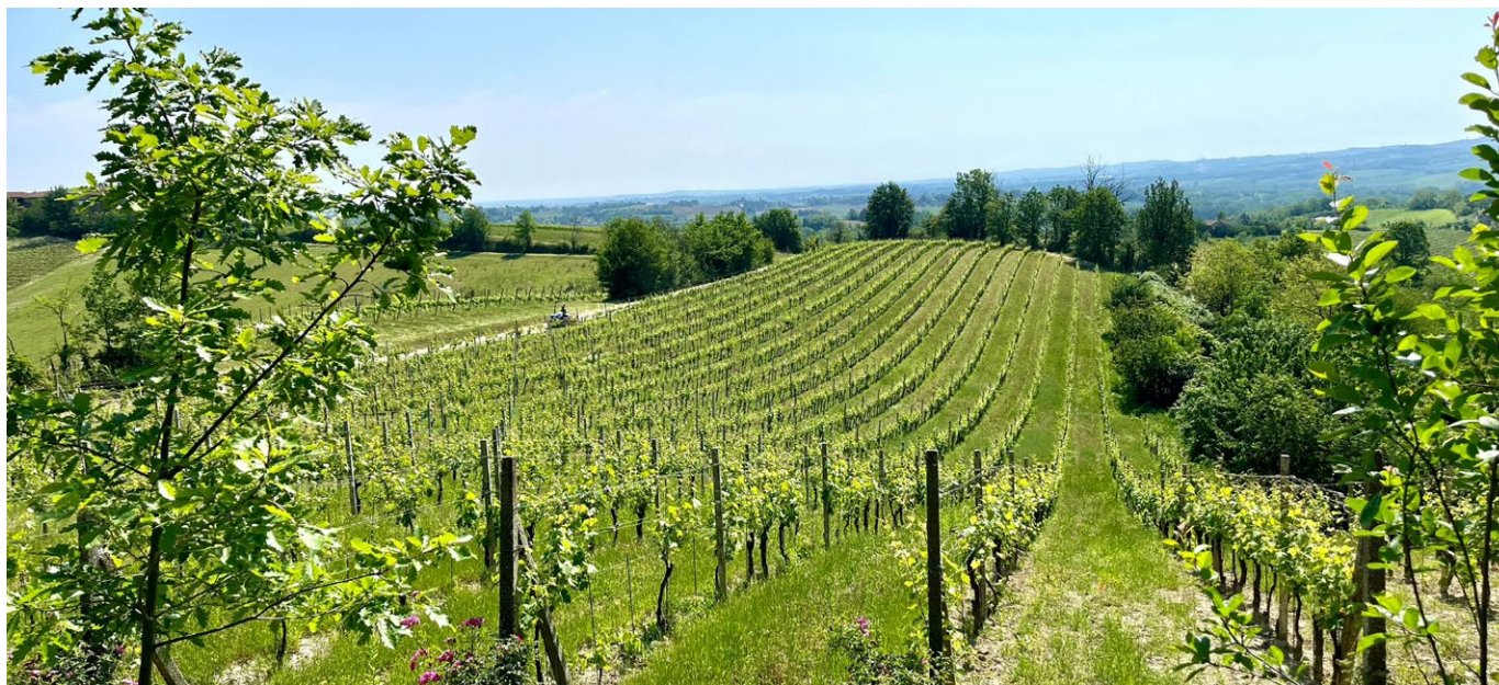
La Casaccia's Monferrato vineyards in Cella Monte