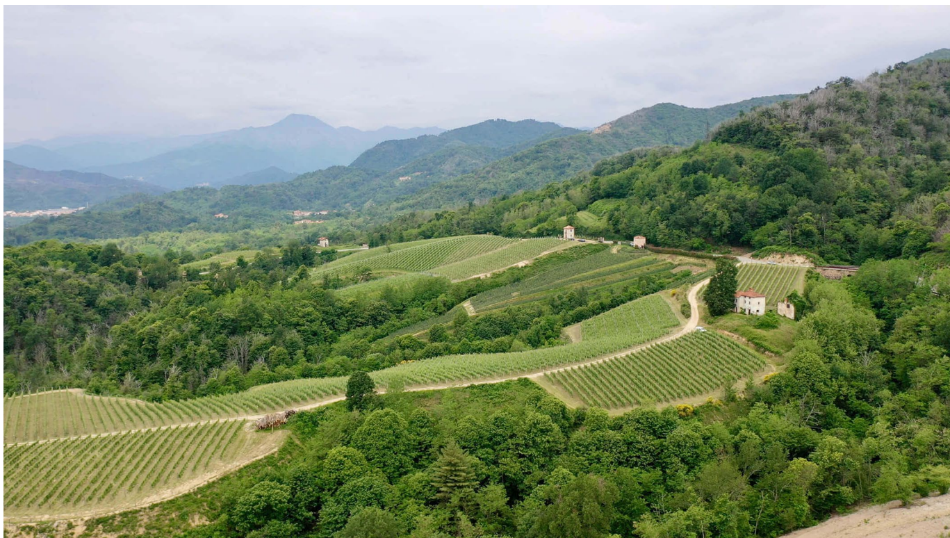
Boca Vineyards of Davide Carlone located in the Alto Piemonte foothills of the Alps