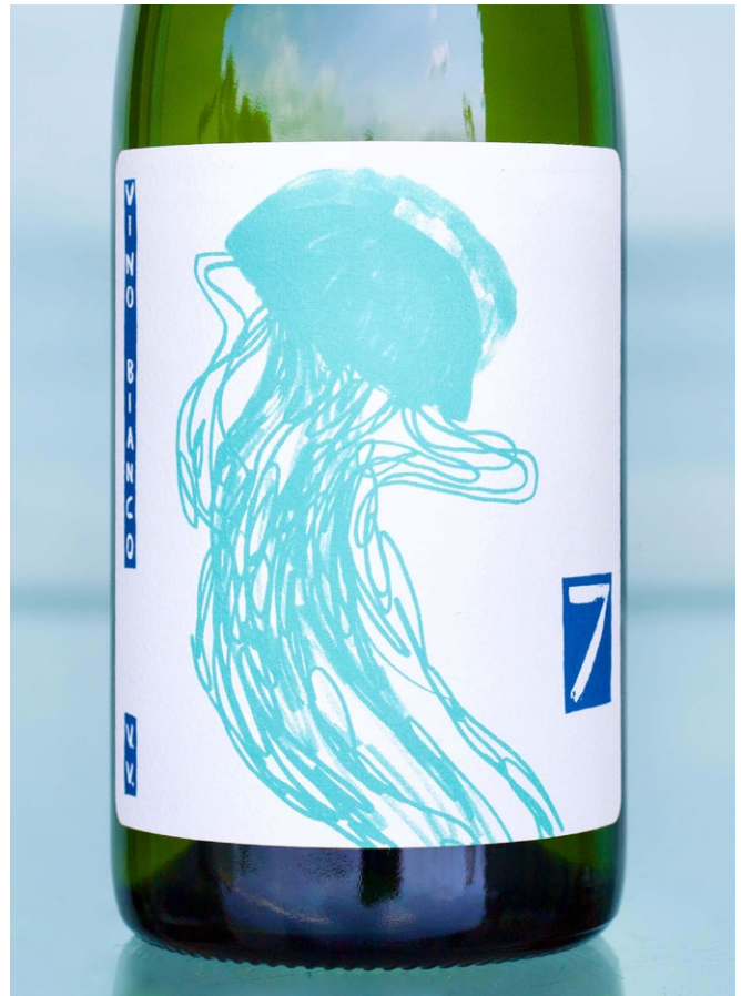
Sette's Vino Bianco

Another advantage is that they have the terroir with enough talent to go beyond "good value wine" and into the world-class. The ingredients are there: limestone and chalk with extremely active calcium, sandy limestone, gently sloping hills (preferential to steep ones with looming climate change toward hotter temperatures) with great variations of soil grain to put grapes