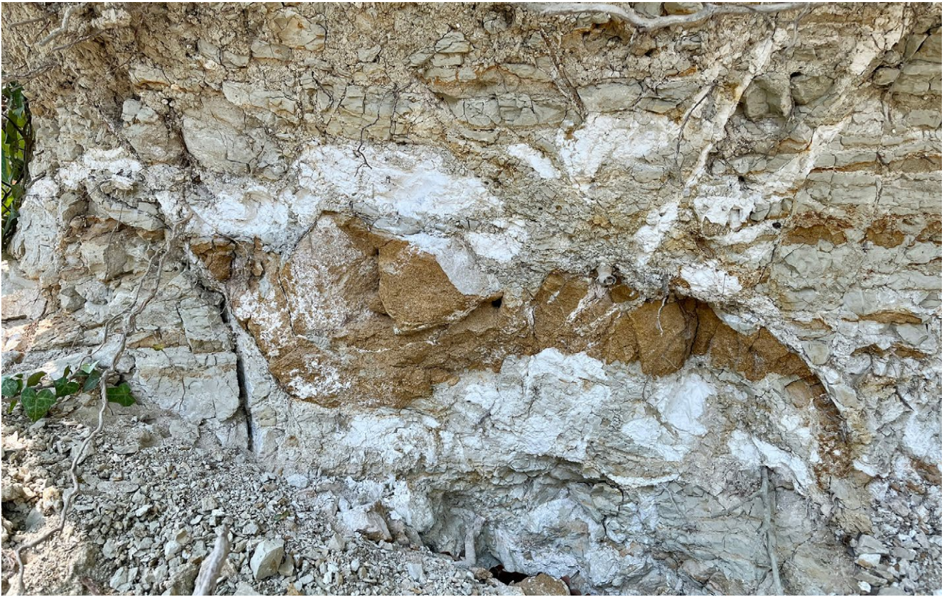
Vineyard soil cut demonstrating the layered geology at La Casaccia of limestone, chalk, limestone-rich clay and siliceous sands

on their most favorable soil types (Grignolino on sand, Freisa on clay, Barbera in the middle), tremendous biodiversity with swaths of indigenous forest between vineyard parcels and sometimes right in the middle of them along with a multitude of intended crops (well beyond the occasional hazelnut grove as seen in much of the Langhe's prized vineyard areas where grapes aren't suitable), and a climate that's conducive to organic and biodynamic vineyard culture.