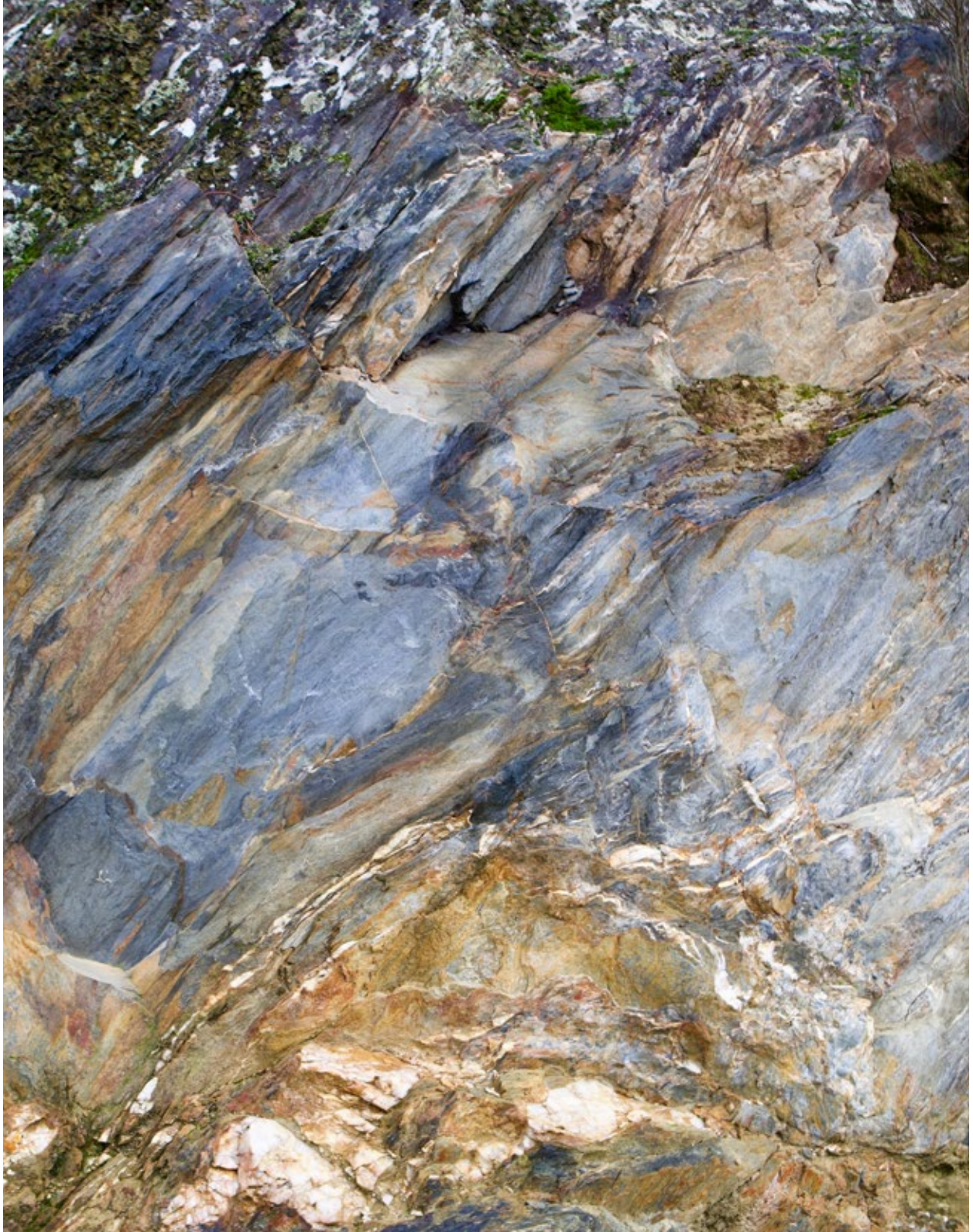
SLATE RIBEIRA SACRA