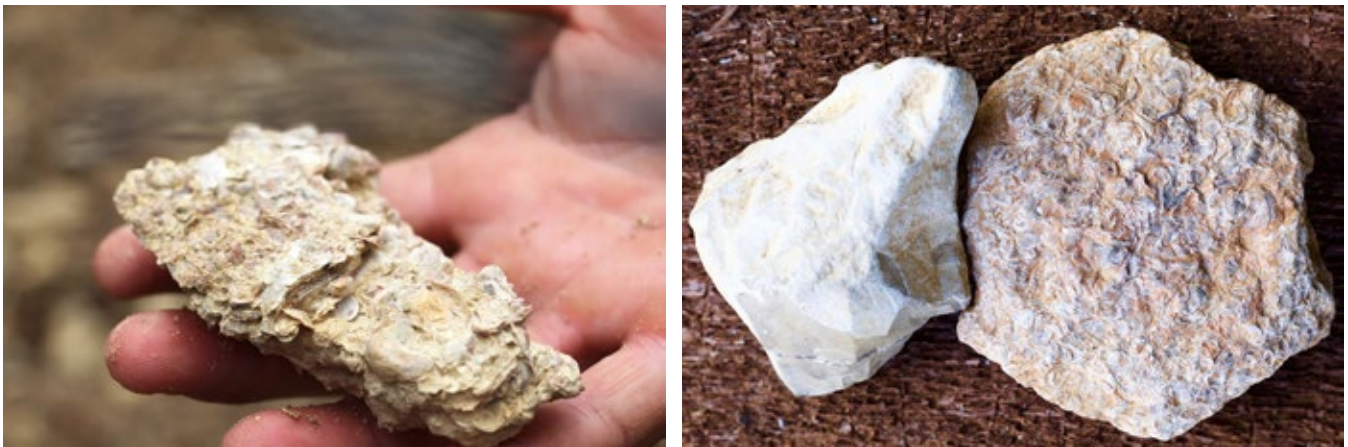
Left: Extremely friable Kimmeridgian marl. Right: Portlandian limestone (left) and Kimmeridgian limestone marl (right).

Both formations appear together in some of France's most emblematic wine regions, most notably Chablis and the southern end of Champagne, in the Côte des Bar (or Aube). The classical vineyards in Chablis are rooted in Kimmeridgian bedrock, while the higher slopes of Petit Chablis rest on Portlandian layers that cap the older marls. There's a similar pattern in the Aube, where celebrated parcels—particularly around Les Riceys, Bar-sur-Seine, and Montgueux—tend to lie over Kimmeridgian marl; the region does not formally classify vineyards by soil type.