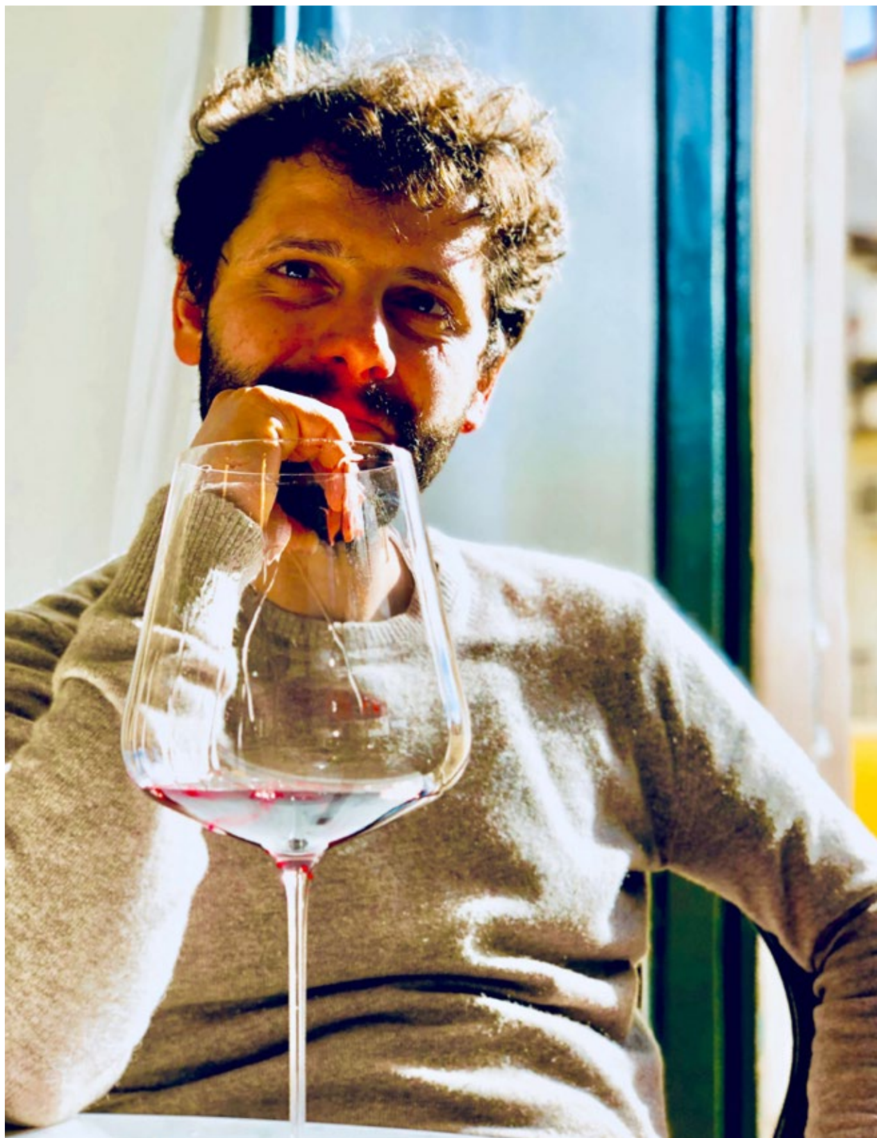
PAOLO LATORRACA MADONNA DELLE GRAZIE