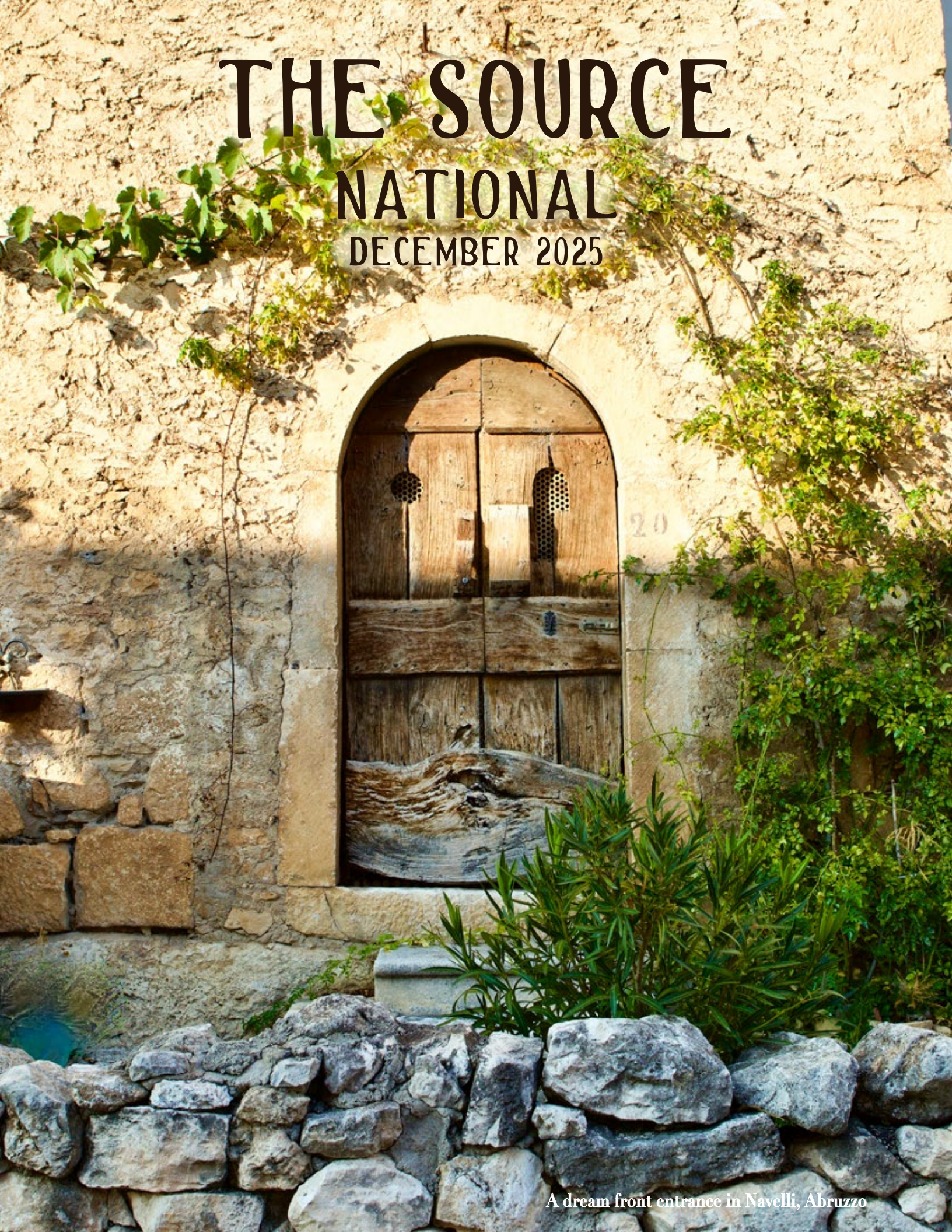
A dream front entrance in Navelli, Abruzzo