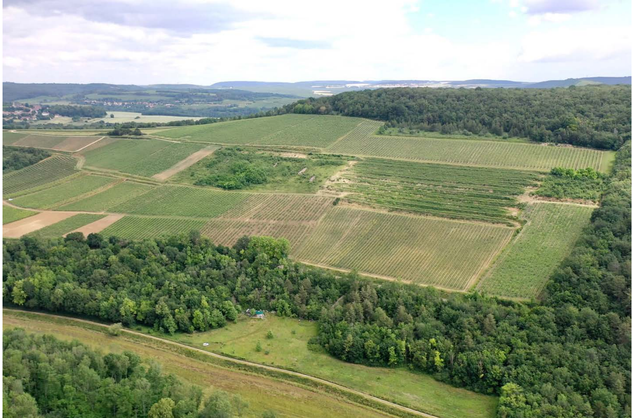
Hautes-Côtes de Nuits principal location for 'Louis Auguste' bottling

In 2023, the aromatic appeal of the HAUTES-CÔTES DE NUITS 'LOUIS AUGUSTE' is more pure and elevated earlier on than in any other year I remember. In many years past, it had to jump the hurdle of reduction, but this year, that's nowhere to be found in the nose for more than a short moment. Perhaps this is the most upfront and elegant version of this wine I've had since the 2008 vintage we first imported. It comes from parcels in Chevannes, planted in 1995 on very steep slopes with south and southwest exposition, at 335–455 meters, on limestone bedrock and shallow, rocky clay topsoil.