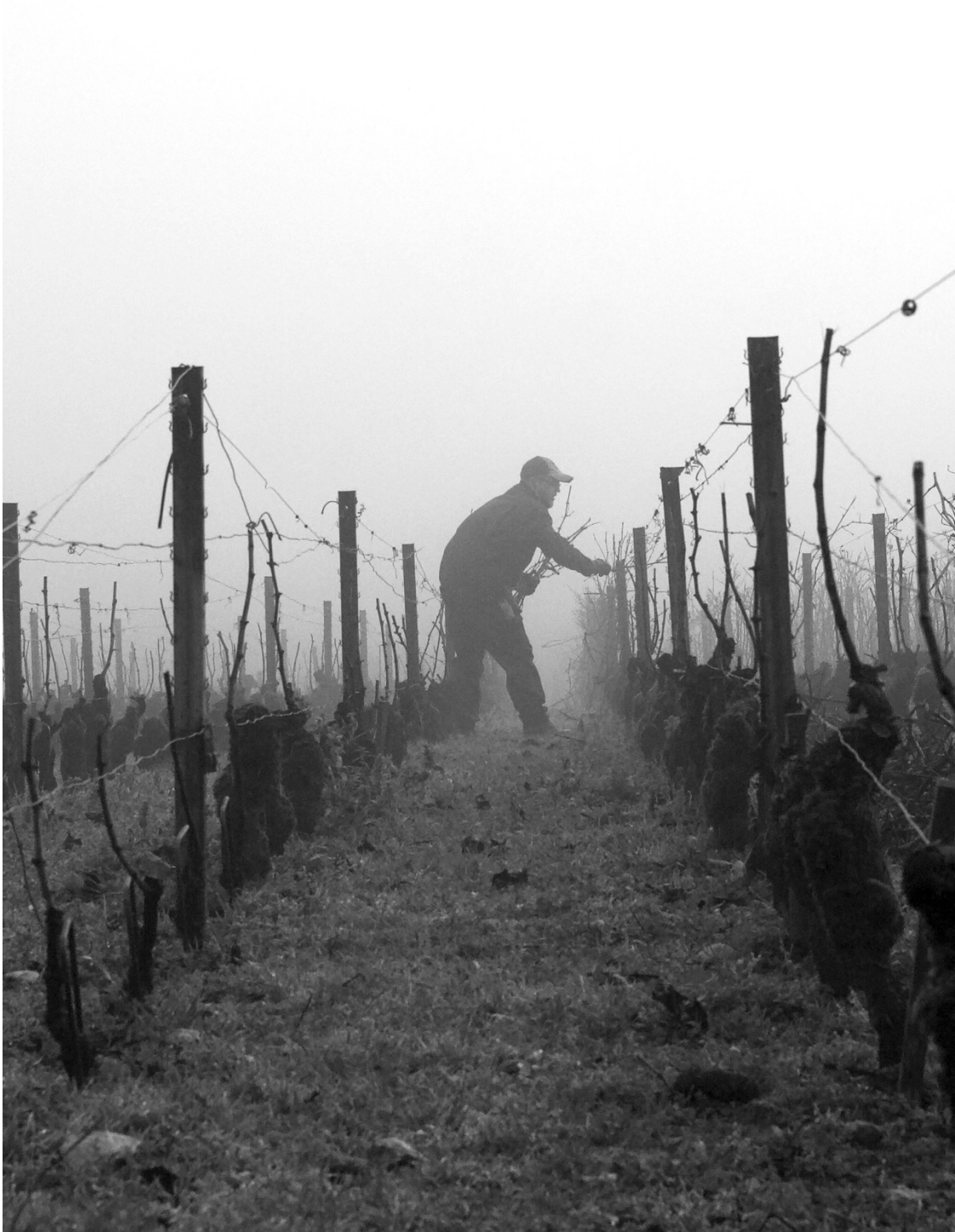
Pruning in Les Damodes, December 2025