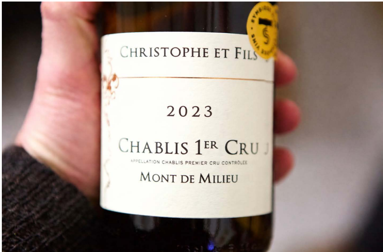
New label design coming for the 2024 vintage

FOURCHAUME is the most muscular wine in the range of Sebastien’s premier cru Chablis. Deeply textured in the nose and the palate, the wine shows grit and dense, mineral impressions. This is one of the great premier crus on the right bank of the Serein River. Planted in 1981 at 120-130 meters altitude and just north of the grand cru vineyards, Fourchaume nearly picks up where they left off. It comes from the lieu-dit, Côte de Fontenay, situated on a perfect south-face, which is advantageous for achieving full ripeness in colder years.