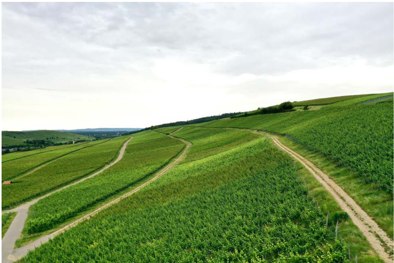
Möblin to the far left a little downslope

They are soft on extraction with very few punch downs during fermentation, only the occasional movement of the cap, mostly by hand, to ensure a healthy beginning. Sulfur is used judiciously (no more than 30-50 parts per million in total) and not applied until after malolactic fermentation. Their theory on the timing of the first sulfur addition is that the tannins would be more smoothly integrated than with additions beforehand, especially when there are whole-cluster fermentations involved. (When it's added during the vinification period—including primary and malolactic fermentation—the wine has more time to clearly define itself; while those that have earlier additions before fermentation potentially maintain harder tannins that could take much longer to evolve in the bottle, it leaves some of the best potential moments of the wine's life subordinate to a potentially overbearing tannic structure.) The wines are all aged in oak barrels, but it's too early to say what their practice will be from one vintage to the next concerning the amount of new oak—they are still discovering what works.