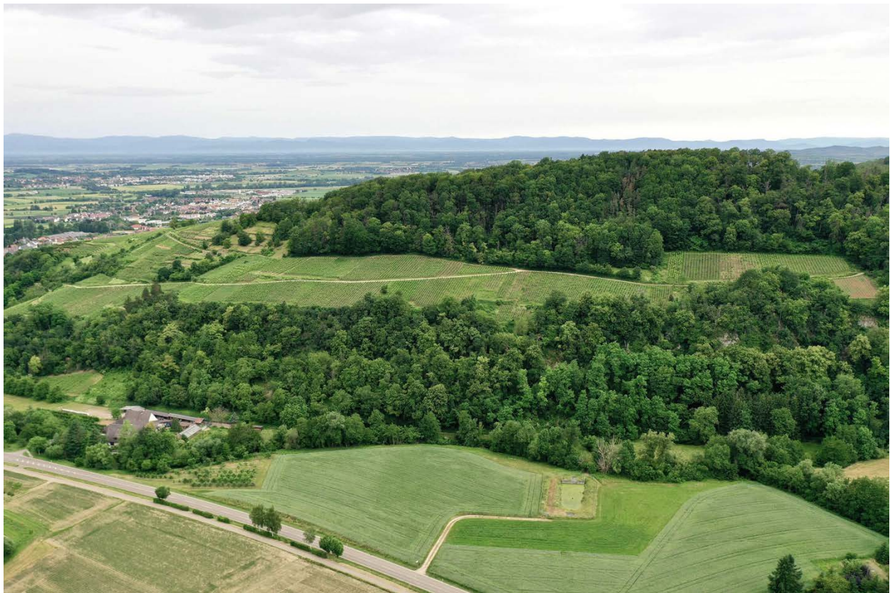
Möblin to the far left a little downslope

The WEISSBURGUNDER "MÖHLIN" comes from Pinot Blanc vines planted in the 1950s on a very steep slope facing south-southeast at 350m on limestone and clay.