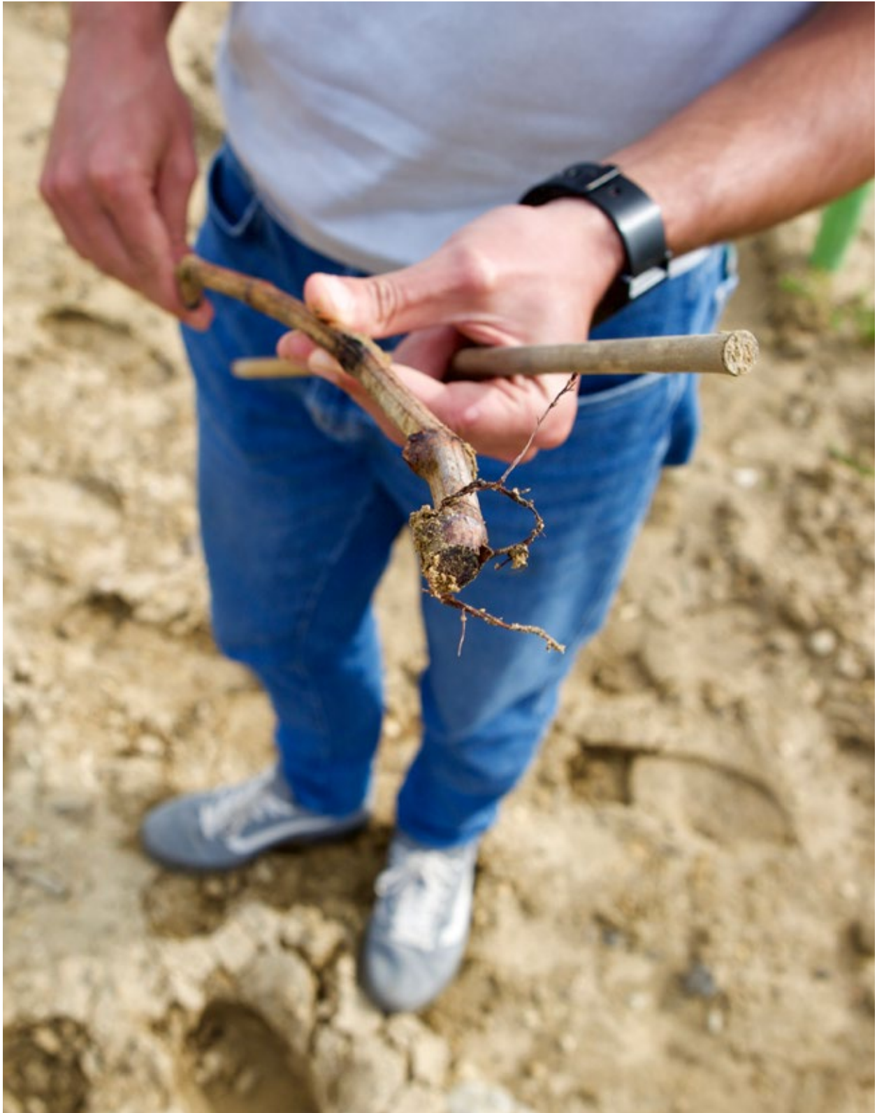
QUINTA DE SAN MICHEL UNGRAFTED VINES IN COLARES, PORTUGAL