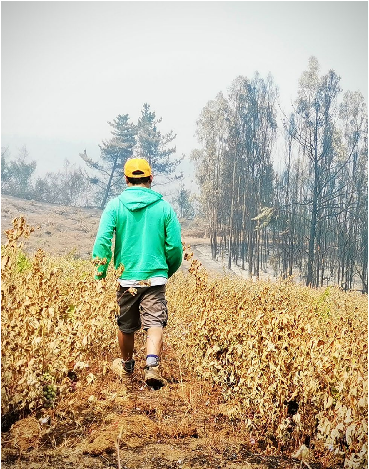
LEO ERAZO ITATA VALLEY VINEYARDS AFTER THE 2023 FIRE